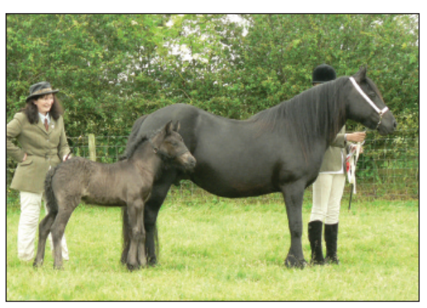
First outing, a Carrock filly foal with her dam Townend Dawn II at the FPS South Cumbria Show.