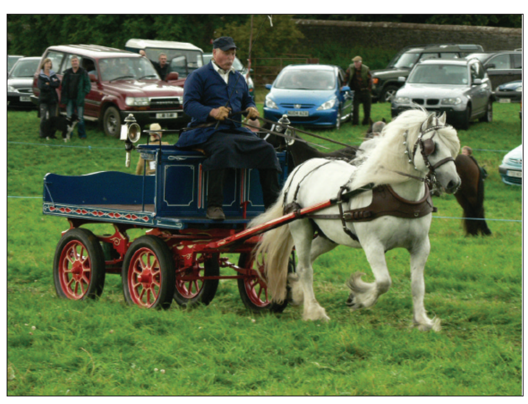
Keeping the tradition, Severnvale Grey Bobby put to a trade turnout at the 36th FPS Breed Show.