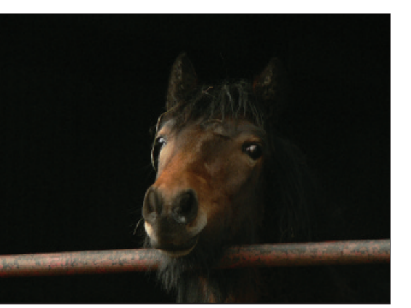
Thinking of Spring: yearling filly Bybeck Georgie Girl.