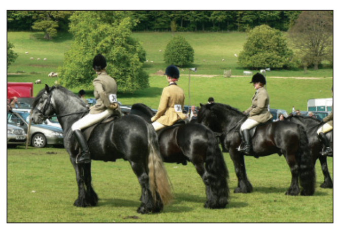
Final placings: ridden stallions line up to collect their rosettes, Severnvale Denzil in 1 st place.